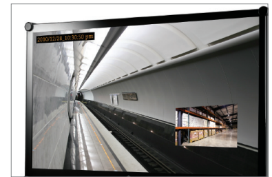
On top of PIP and PBP, Smart Omni Viewer offers selectable aspect ratios and the option of 180° image rotation