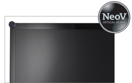
NeoV™ Optical Glass protects against scratches, impacts and other physical damage