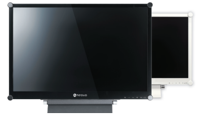
Available in black or white