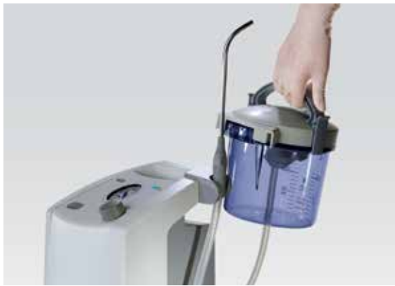
Removal of the secretion tank

During a surgical operation, the patient needs all the attention. Therefore the medical team needs to rely on powerful systems that work impeccably. Such is the infinitely variable VC 45 Surgical Suction Unit that meets surgical requirements with a suction volume of 45 l/min with a constant high vacuum of up to 910 mbar.