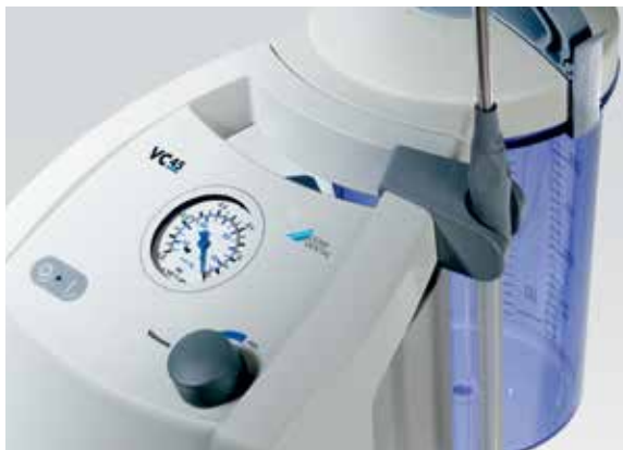
Maximum vacuum of up to 910 mbar