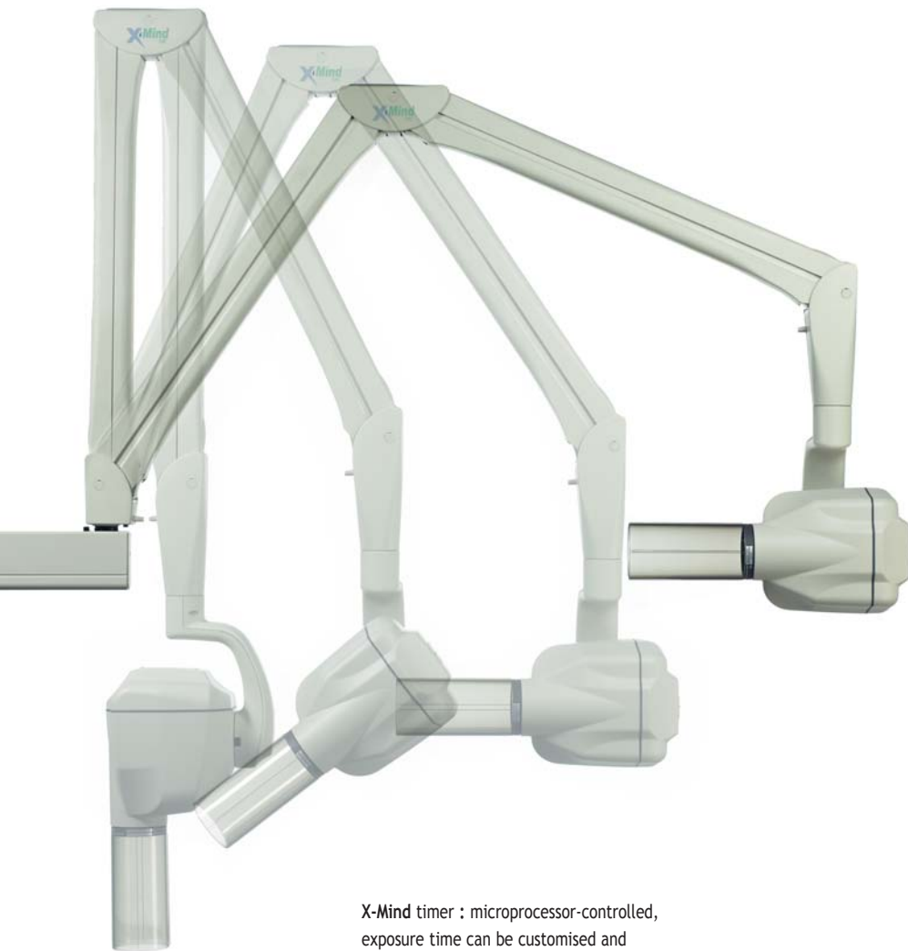
31cm (12") long cone, head rotates through 395°.

X-Mind timer ; microprocessor-controlled, exposure time can be customised and programmed, one key allows you to switch immediately from conventional intra-oral X-ray to digital X-ray. Pre-programmed keys for special pictures.