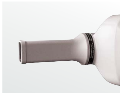
Short cone* 20cm (8").